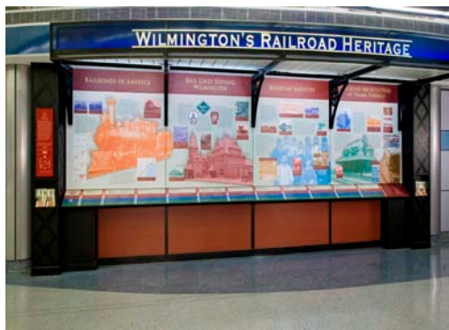
Permanent exhibit at the Wilmington Station