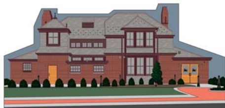
B&O Water Street Station collectible

Thanks to a donation from North East Contractors, Inc., we were able to create a collectible cut-out of the B&O Water Street Station, restored by ING Direct, now Capital One. Both this and our Wilmington Station collectible cut-out are available for purchase from FFRD. The sales of these items, along with greeting cards, note cards and other ephemera, continue to provide an income source for FFRD activities.